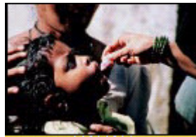
Polio Plus Providing Immunizations

Rotary Foundation: Develops and carries out plans to support “The Rotary Foundation” through financial contributions and club participation in the Foundation programs. Specifically, this committee oversees annual club gifts to Rotary foundation, Paul Harris Fellowships and other Rotary Foundation programs.